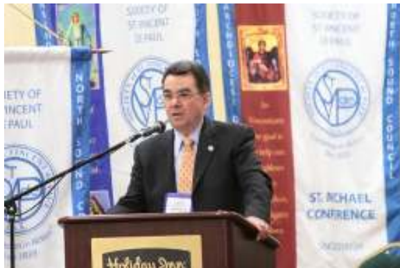
Vice President—Western Region