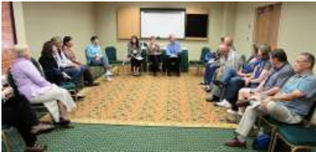
Stores Meeting led by North Sound Council Store Managers