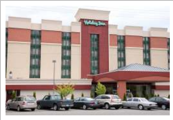
Host Hotel—Holiday Inn—Everett

The North Sound District Council hosted this year's Western Regional Conference in Everett last June. Over 250 attendees from the ten Western states participated in the workshops and functions.