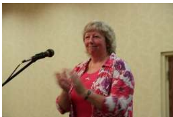
Job Well Done by All!