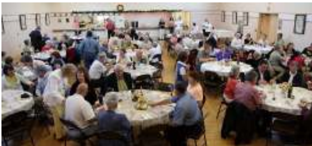
Salmon Dinner at Our Lady of Perpetual Help