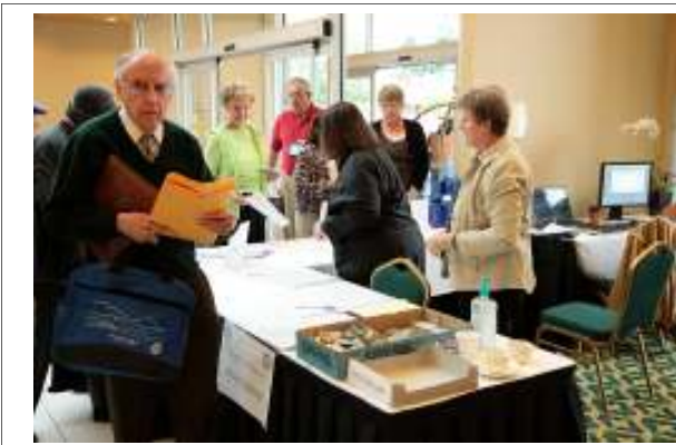
Conference Registration Desk